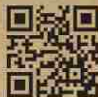
Way to TIES