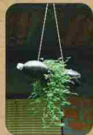
Solutions are simple...