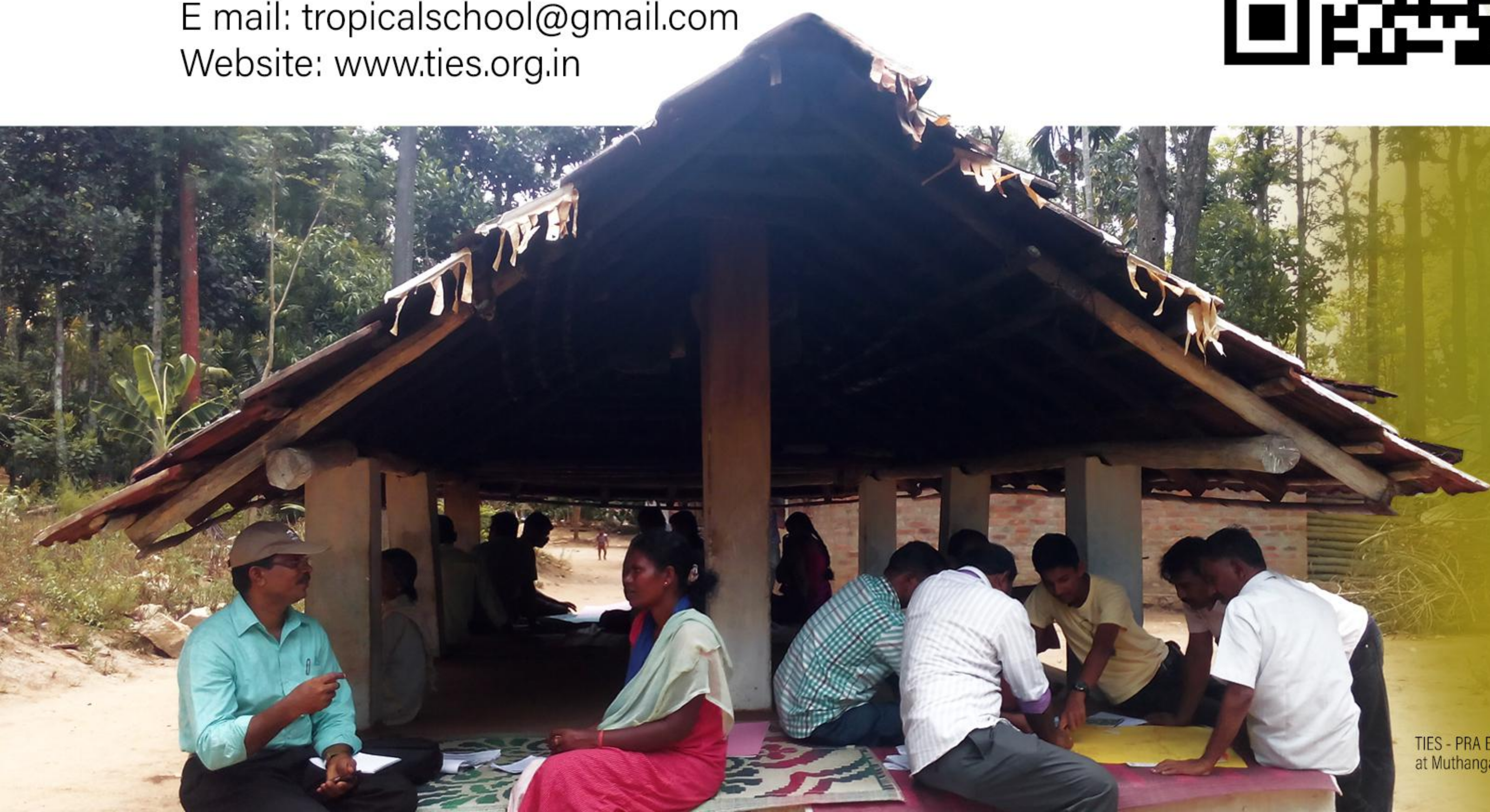
TIES - PRA Exercise at Muthanga forest